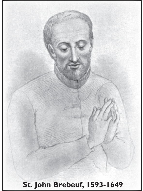
St. John Brebeuf, 1593-1649